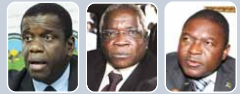
Top left, Davis Simango, Afonso Dhlakama and Filipe Nyussi, the Presidential candidates to contest the Mozambique elections.