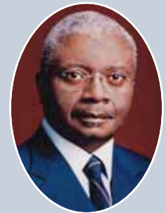
Mozambican President, Armando Guebuza

If elected on 15 October this year, he will become the first President to originate from the north of the vast country that stretches 2,470 kilometres along the south-east coast of Africa between Tanzania and South Africa, although the current President Guebuza, who is from the south, also grew up in the north and fought in the liberation war.